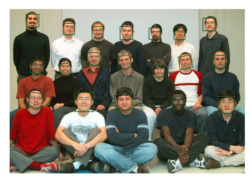
Figure 1: Detection of faces in a photography.

This package contains a system that provides real time object detection. By the objects, in this case, we mean anything with stable pattern (e.g. face, car rear, etc.). The detection is based on a classifier trained by AdaBoost (or its modification) algorithm. Example of an output of face detection is shown in the Figure 1.