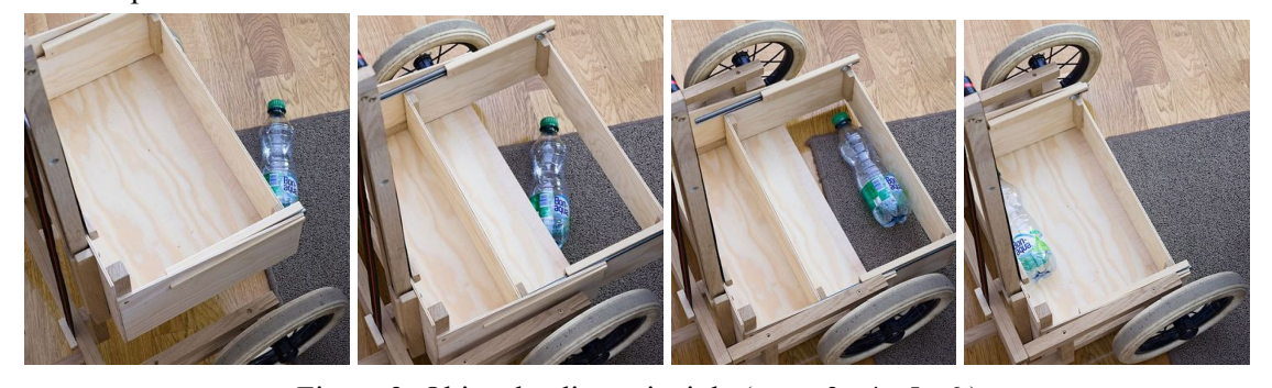
Figure 2. Object loading principle (steps 3., 4., 5., 6.)