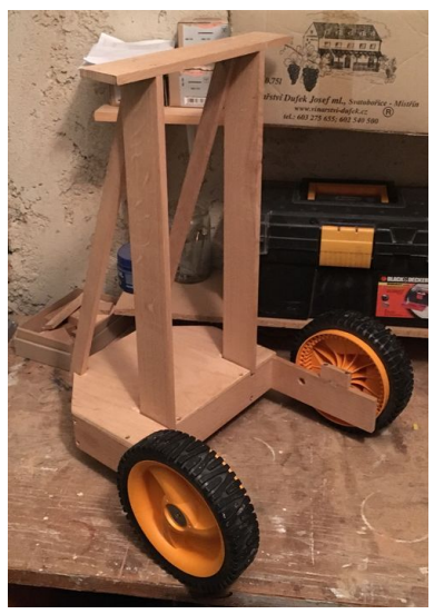
Figure 3. The contruction mock-ups.