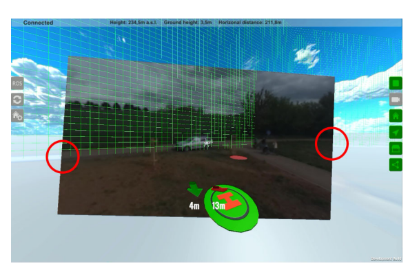
Figure 4: Screen of the implemented application based on augmented virtuality. The virtual environment model is augmented with the data from the real drone – position and orientation, which are used to render the virtual drone in the scene; camera image that is aligned with the virtual environment model (marked with the red circles); and other sensor data. This environment model can be enriched by virtual walls (the green grille) that can mark restricted areas or with a waypoints and direction arrows.

It was much easier to do the fly around and survey