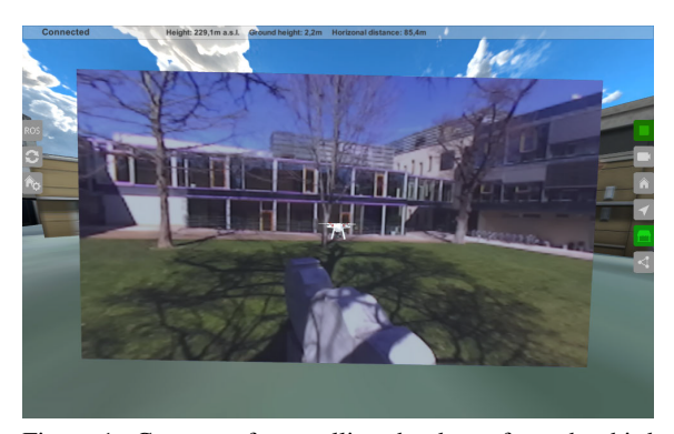
Figure 1: Concept of controlling the drone from the third person view. The virtual screen (with the video feed) moves at a certain distance in front of the drone and is synchronized with the physical gimbal configuration.

trol the drone and observe the scene from a new virtual position.