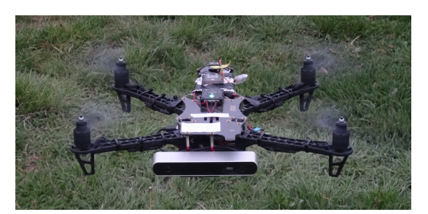
Figure 3: Test drone with Pixhawk control unit, ZED stereoscopic camera and Nvidia Jetson supercomputer, shot just above ground.

When using a drone, for example, in the service of the police, it is often necessary to monitor an area (road,