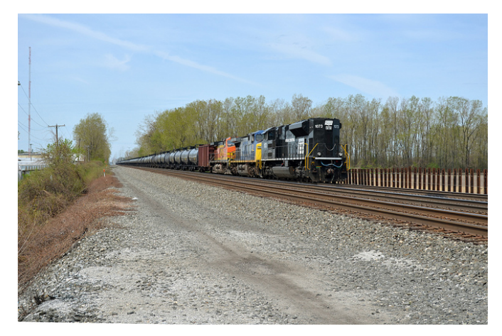
(a) Query image